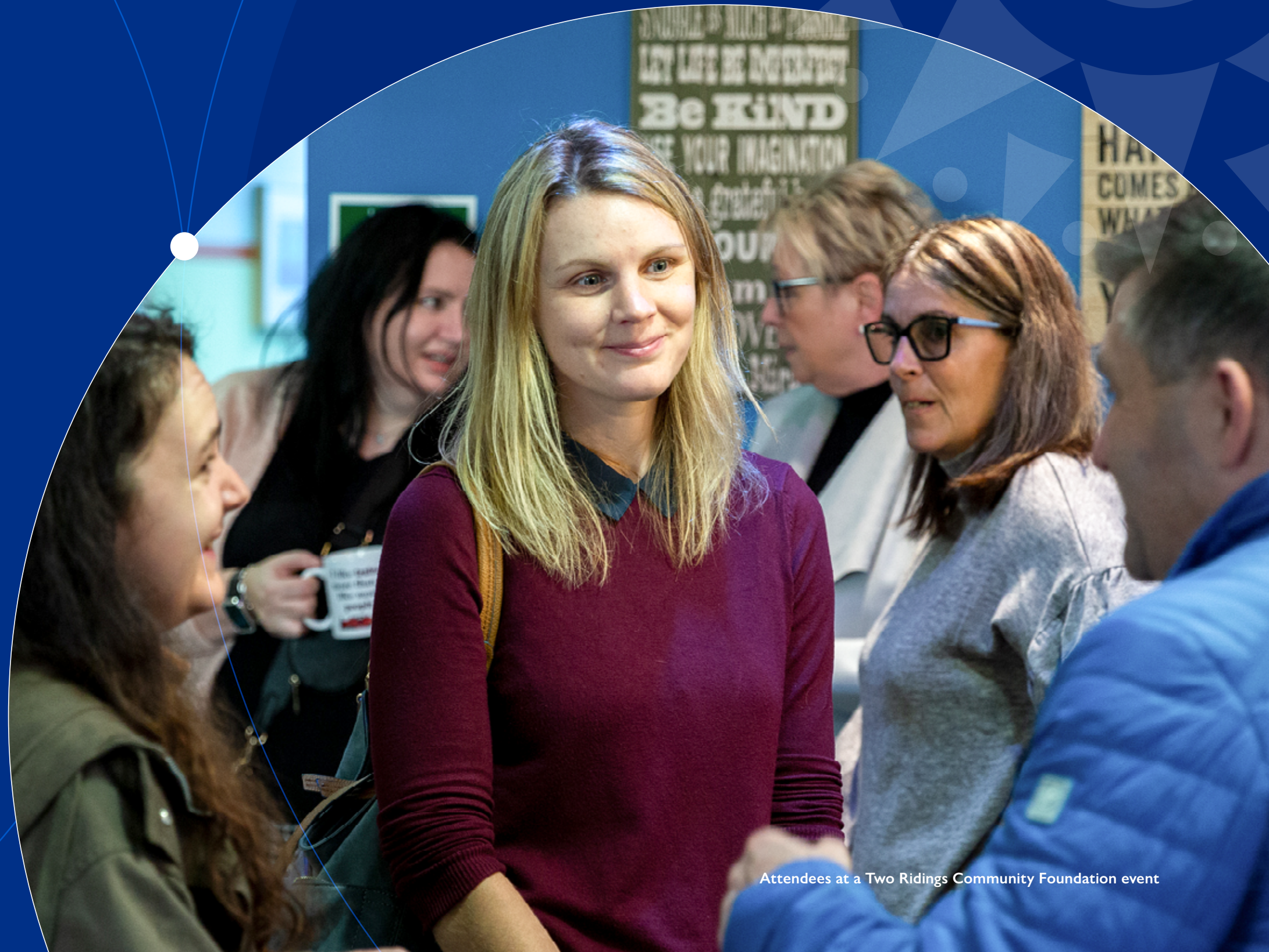
Attendees at a Two Ridings Community Foundation event

the role of local giving in addressing regional inequality and building community resilience