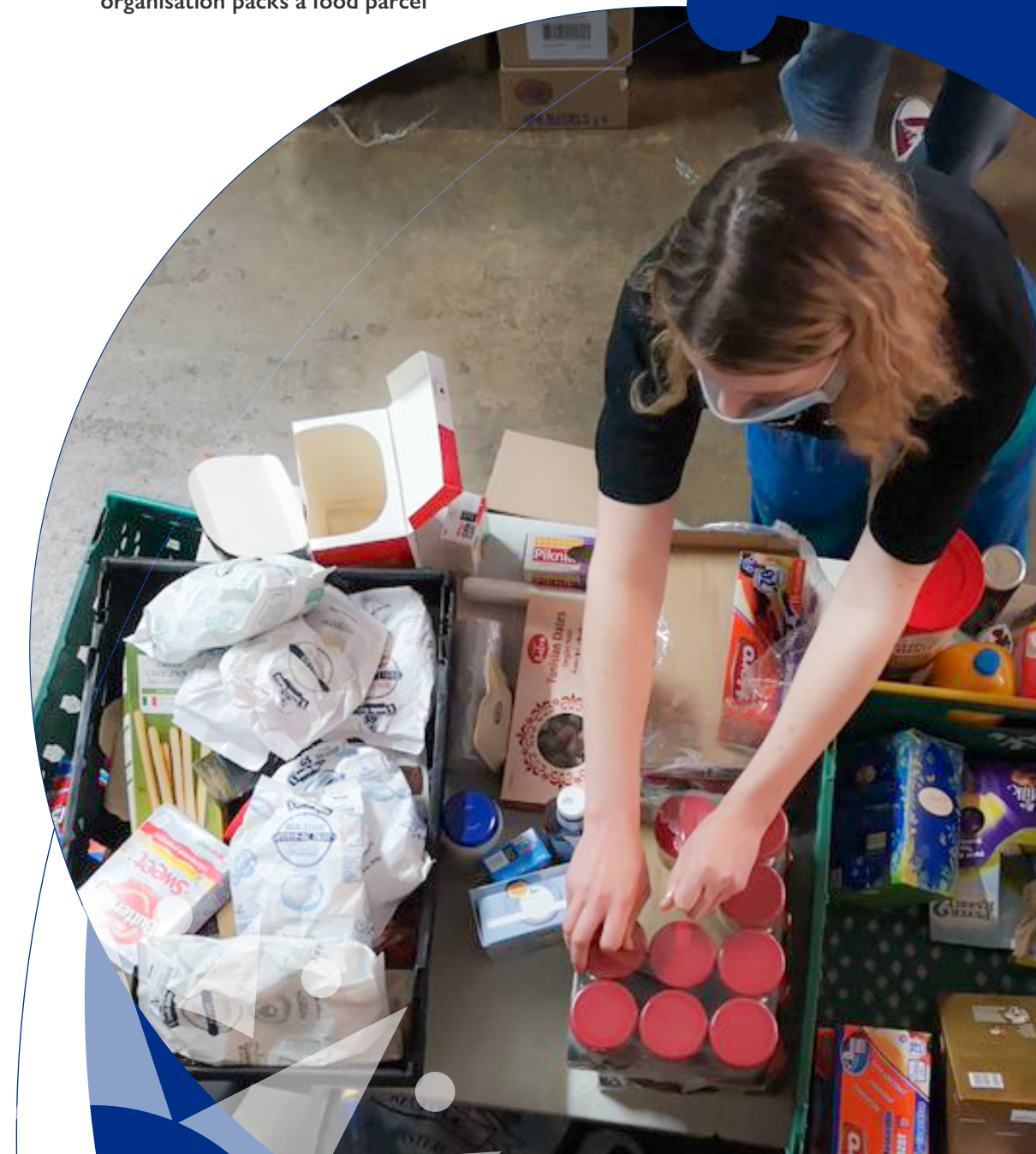
A volunteer from a South Yorkshire's Community Foundation funded organisation packs a food parcel

UK Community Foundations is the only network of place-based funders that actively generates philanthropy from local donors. In turn, community foundations distribute the funding raised, based on identified regional and community needs. Community foundations have been 'levelling up' communities and addressing regional inequalities for decades. The needs of the most deprived communities have never been more pressing. It is vital we ensure that community philanthropy can be used to improve lives in those places based on an understanding of what they really need.