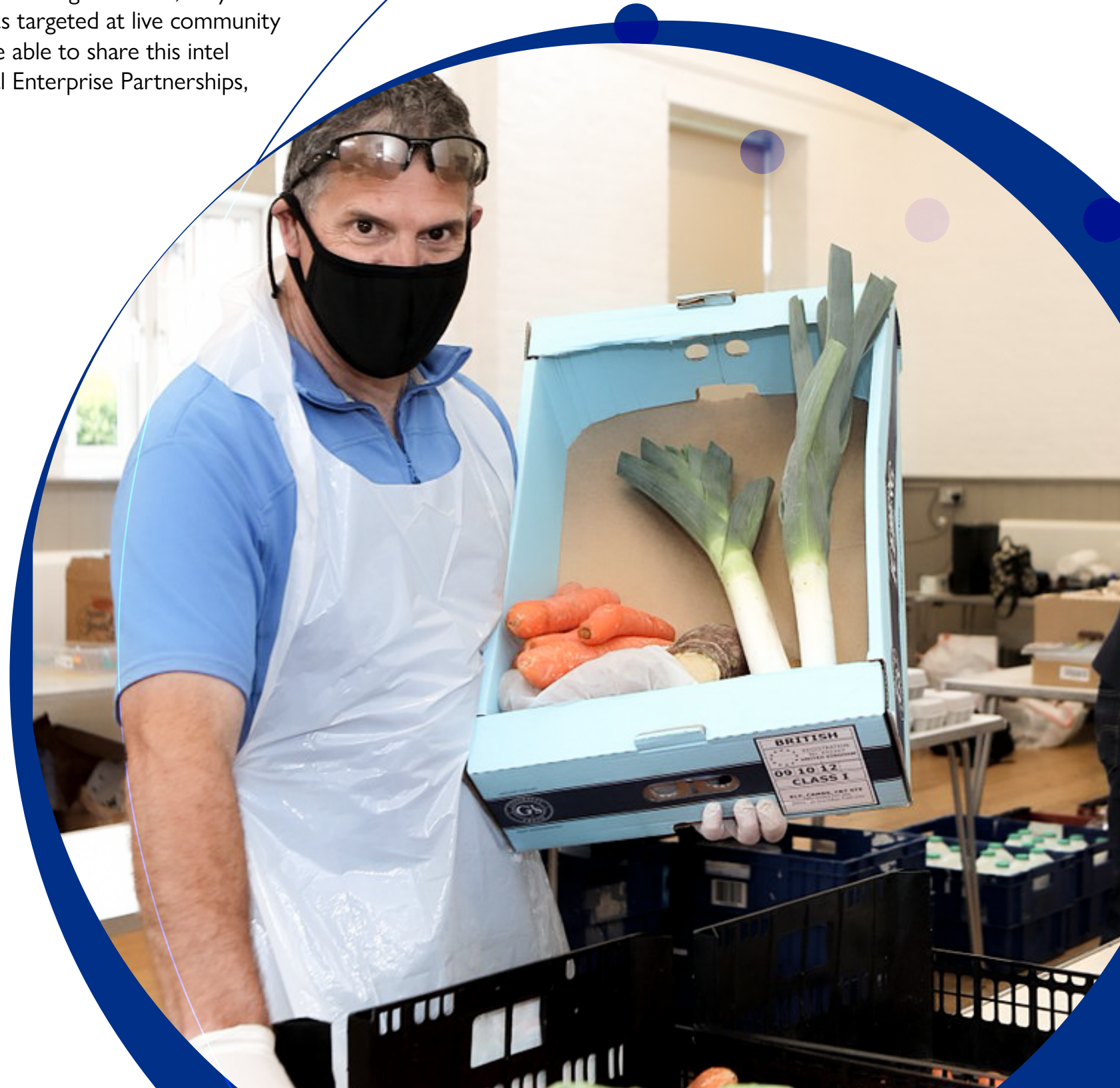
Coronavirus Aid in Chelsham, Farleigh, Warlingham. Supported through Surrey Community Foundation

As the main distribution partner of the National Emergencies Trust's Coronavirus Appeal, community foundations were able to support over 10,000 organisations with £76 million in funding. Thanks to their relationships with local organisations, they were also able to ensure that funding was targeted at live community needs. It also meant that they were able to share this intel with Local Resilience Forums, Local Enterprise Partnerships, and other partners.