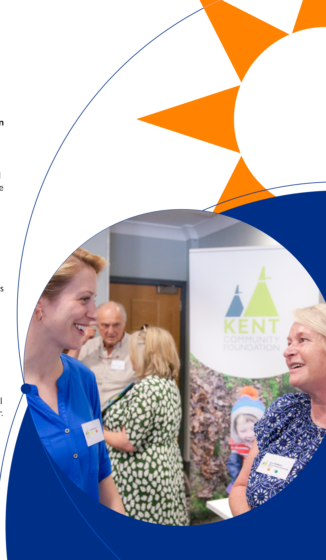
Local people meet at a Kent Community Foundation event to launch its Need Analysis Report

Community philanthropy relies on the active involvement of donors. It is not simply a transactional relationship. It helps to facilitate innovation, collaboration, and experimentation at a local level. It is an essential lifeline to the UK’s vibrant voluntary sector.