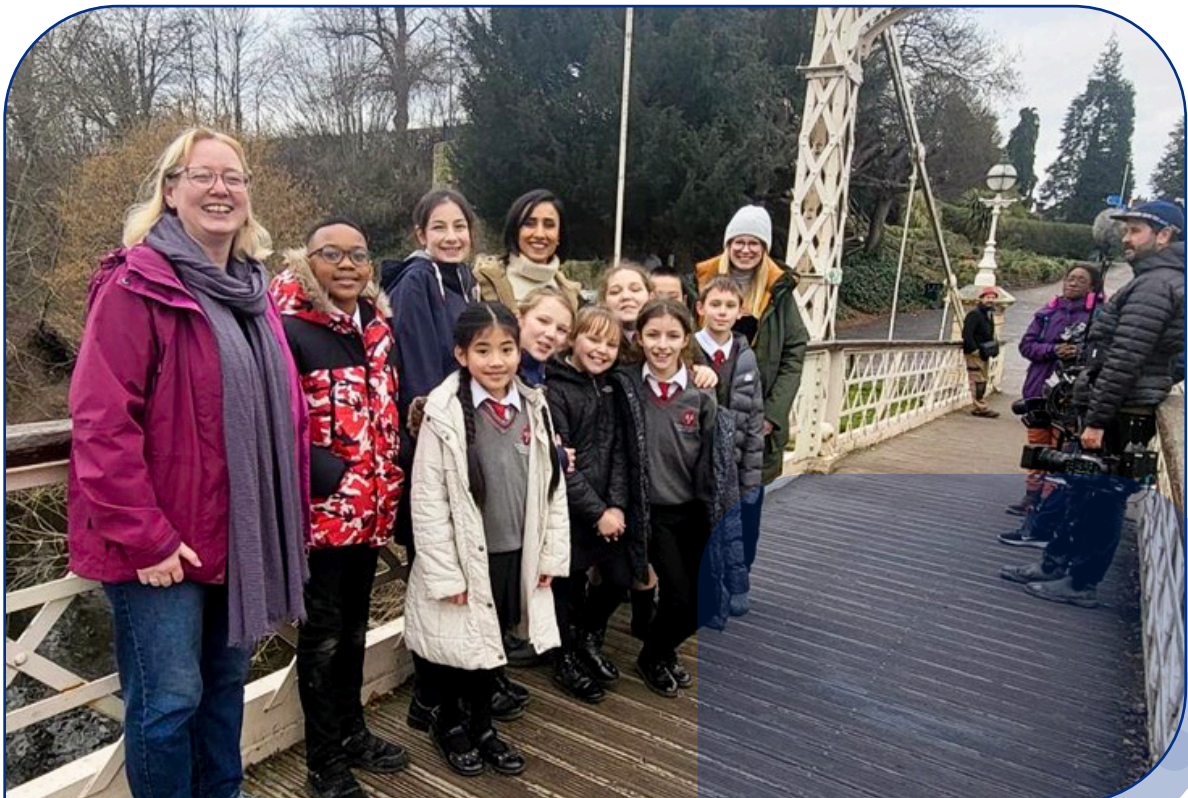
'Children from St. Thomas Cantilupe School in Hereford enjoyed sharing their learning about pollution in the River Wye with Countryfile on the BBC'

With support from Herefordshire Community Foundation, Stories of Change is a project that was set up from the #iwill Fund to get young children involved in understanding the impact of pollution in the River Wye.