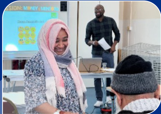
‘Money A+E workshops, funded by The London community Foundation, provide financial education and mentoring’

Talking about their funding from The London Community Foundation, Money A+E said, “Research shows Black Londoners were almost two times more likely to be falling into debt than white Londoners in 2022. This grant will enable us to support diverse ethnic communities and those at risk of financial crisis with the ‘Cost-of-Living Community Outreach Project’, an important series of money education workshops.”