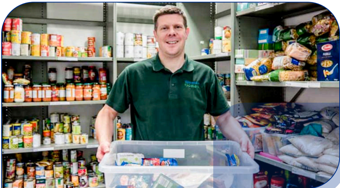
‘Nottinghamshire Community Foundation awarded funding to the Beacon Project, Bassetlaw Food Bank and Clifton Food Bank in 2023 to support people who are struggling or living in poverty within Nottinghamshire’