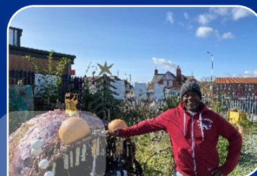
'Rooted in Hull is one of many community-led groups focused on connecting people through volunteering'

Rooted in Hull, funded by Two Ridings Community Foundation, has used Know Your Neighbourhood funding to offer a supportive and friendly space for local people who are marginalised in society to come to. With two new people employed and volunteer sessions three days a week, they hope to offer a more structured project that draws in volunteers to help others.