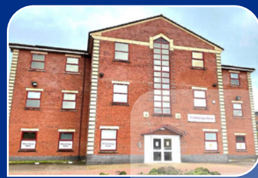
'Philanthropy House is a social investment that provides space and facilities for community-focused organisations'

Renamed Philanthropy House, the building underwent an extensive refit to create two floors of serviced offices and the ground floor, which would be the new home for the community foundation. The building is marketed specifically at charities, community and voluntary groups and social enterprises, offering high quality facilities to smaller organisations that would be unable to afford them in their own right.