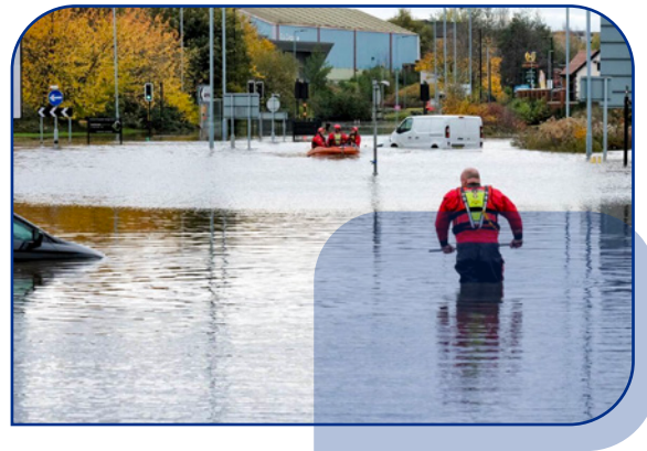
‘Floods are becoming more common in the UK, inflicting long-term damage on communities’

Severe storms and heavy rainfall have become common news over the past decade, with recent floods taking over large areas in Scotland, Northern England, the West Midlands and East England in the second half of 2023.