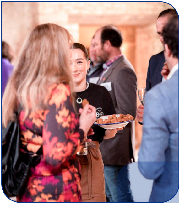
‘Events, like Gloucestershire Community Foundation’s annual event, are a great way of engaging with fellow businesses supporting nearby communities.’

“Our partnership with the Suffolk Community Foundation is extremely important. It has provided us with the opportunity to support important initiatives and events that are central to addressing need in the county.”