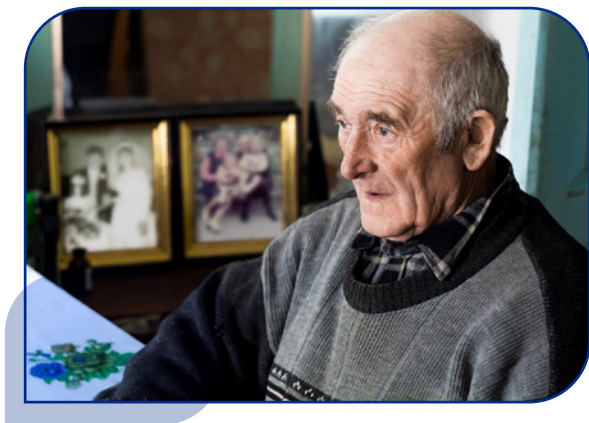
Image – ‘Fuel and food poverty continue to affect people in all kinds of difficult situations, so community foundation support throughout the winter is a lifeline to many’

UKCF launched the Communities in Crisis Appeal at the start of 2023 to top up community foundation support with national donations. £1.35 million was raised, thanks to contributions from M&G Investments, the British Red Cross and the Department for Culture, Media and Sport (DCMS), and was distributed all over the UK.