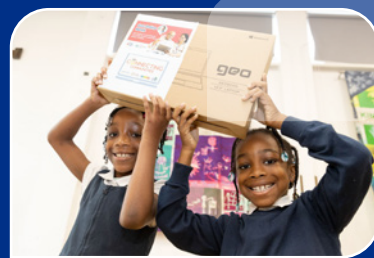
'East End Community Foundation's 'Connecting Communities Programme' focuses on tackling digital exclusion in Tower Hamlets, London'

East End Community Foundation has partnered with the Letta Trust, the London Borough of Tower Hamlets Council, and Poplar HARCA to tackle digital inequality through its Connecting Communities Programme. The programme involves working with schools in Tower Hamlets to identify students and families most in need of support, providing them with a laptop, 12 months' free broadband and delivering a comprehensive digital training programme.