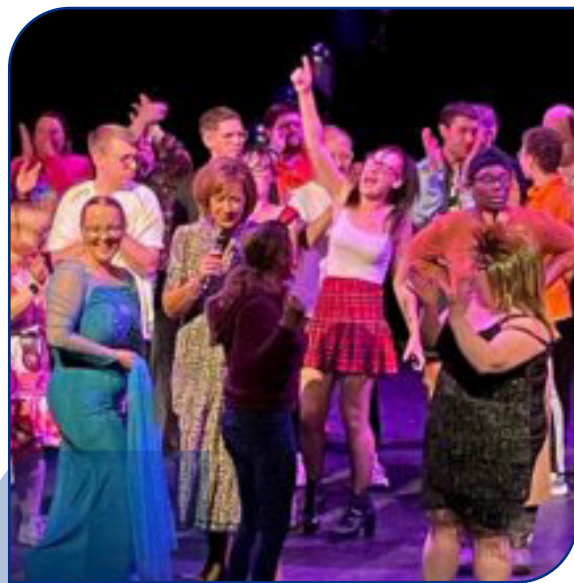
Image – ‘The Monday Night Club has received support from Worcestershire Community Foundation through the #iwill Fund. Its transformative power of inclusivity is building community and confidence for people with additional needs.’