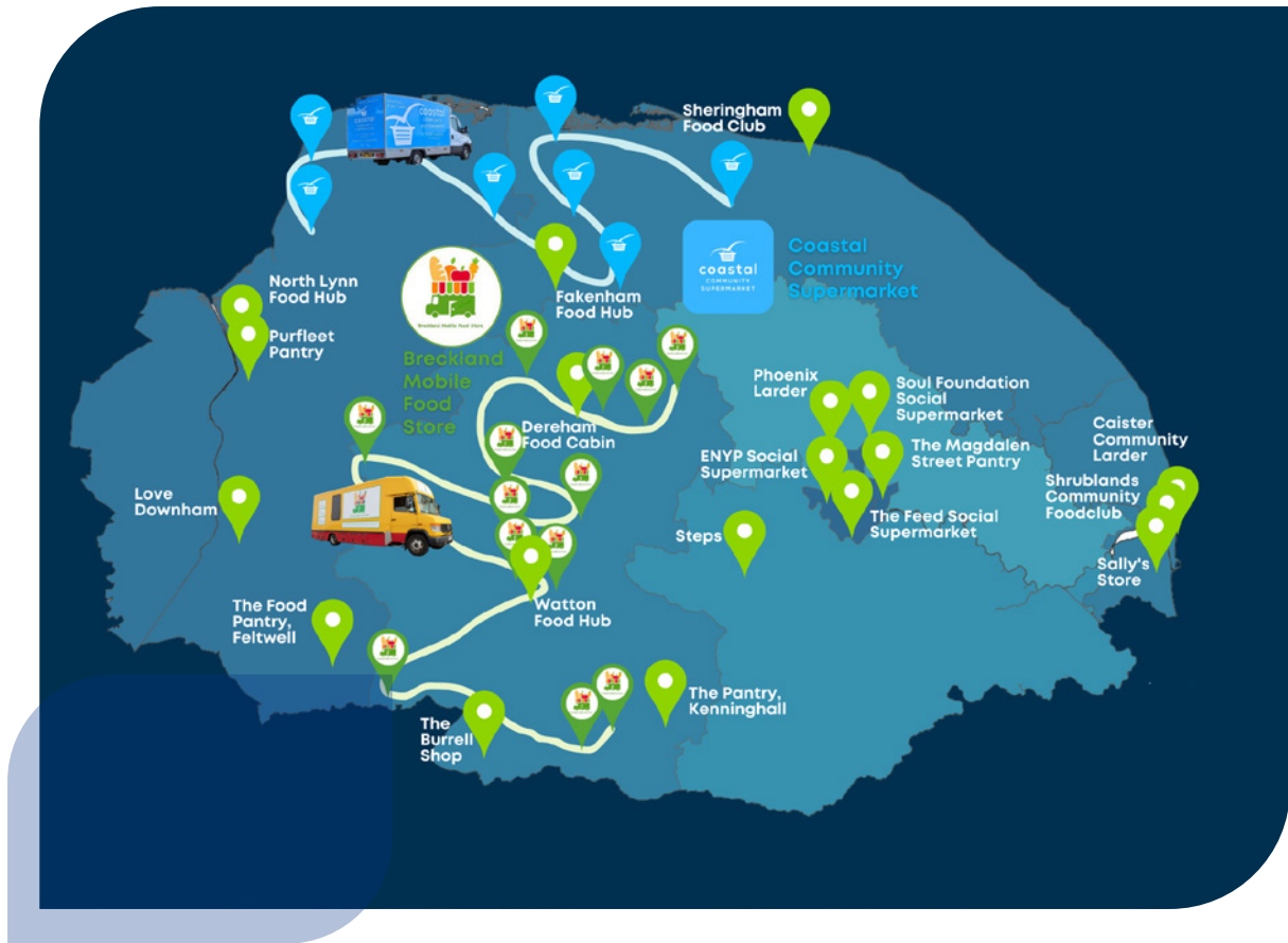
'Nourishing Norfolk is a scheme that was established with multiple council partnerships to put social equity first through place-based philanthropy'