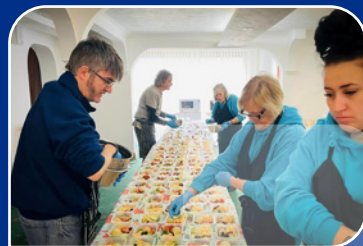
‘Volunteers at DISC prepare healthy meals and clothing for Newquay’s homeless community.’

Newquay has a large homeless population. DISC (Drop In and Share Centre) has received continued support from Cornwall Community Foundation throughout the past few years. Volunteers have seen increasing demand for essentials in the region.