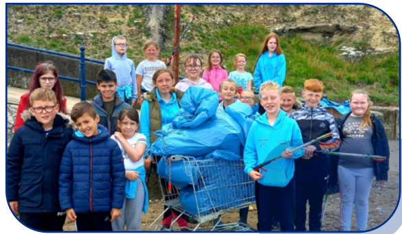
‘Children in County Durham, supported by County Durham Community Foundation as part of the match-funding #iwill Fund, have been able to take part in youth social action activities’

The multi-year programme, first established in 2015, has focused on supporting young people into youth social action through various activities, from taking part in school councils to volunteering at care homes. By match funding with local donors, participating community foundations in England have so far doubled the original fund of £6 million to over £12 million.