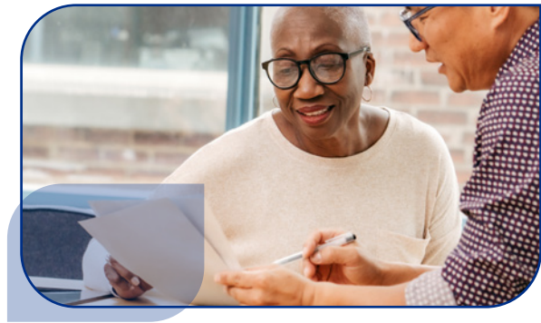
‘Community foundations offer a wide variety of options for those wanting to give back’

Community foundations make legacy giving easier so that families and friends can focus on the important aspects that matter. They offer a bespoke tailored service and take away the administrative burden of setting up a separate charitable legacy trust/foundation with the Charity Commission.