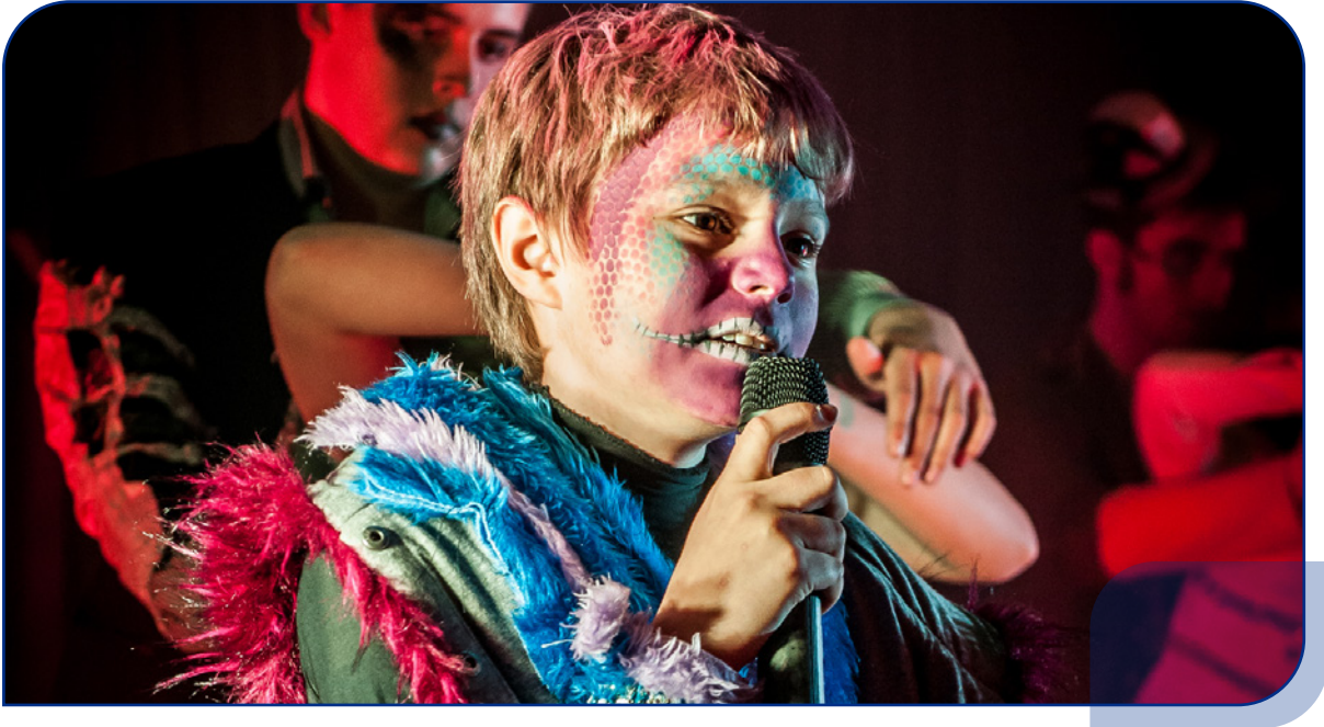
'Cleveland Ironstone Mining Museum's Feast of Fun project showcased its 'Illusions of Wonderland' show to local audiences in County Durham, through our Let's Create Jubilee Fund'

Analysis of the grants awarded showed a wide geographical spread of activities, with projects having benefited a wide range of people across the country in terms of protected characteristics and socioeconomic backgrounds. The programme also showed the huge demand for creative support from local community organisations, receiving four times the required amount of funding applications.